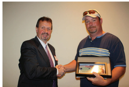
Reliable Fence, Hauling