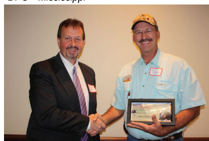
M & B Farms